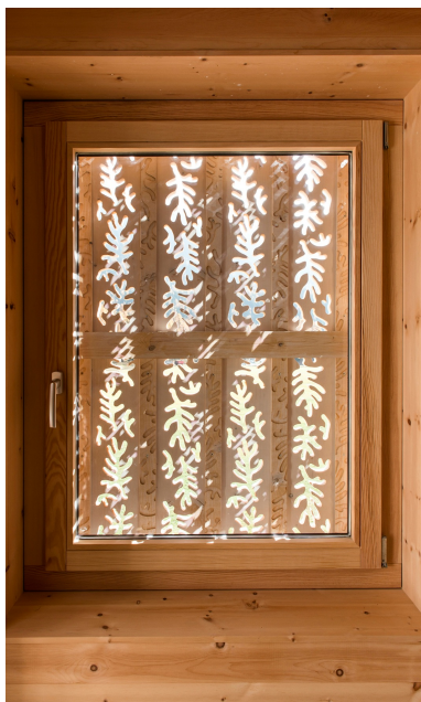
Ornamentation on the facade is also visible inside