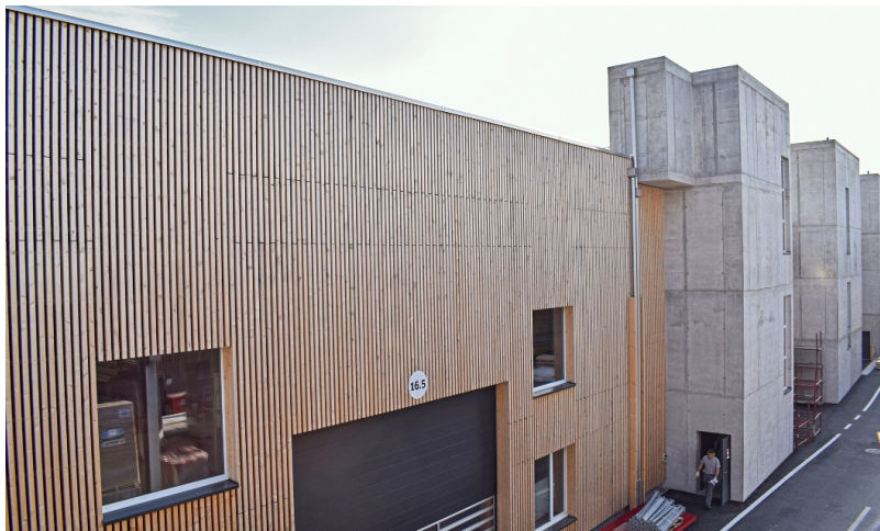
Hall construction in impressive dimensions