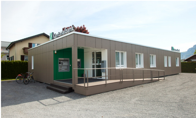
Entrance with wheelchair-accessible ramp