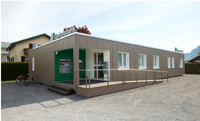
Entrance with wheelchair-accessible ramp