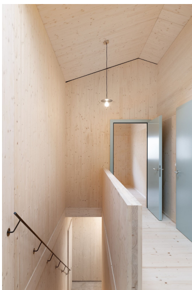
The two-storey section of the new building houses living quarters for staff working there.