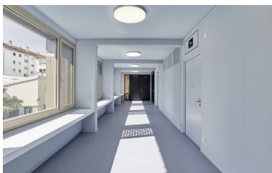
Spacious school hallway with bright windowsill to linger.