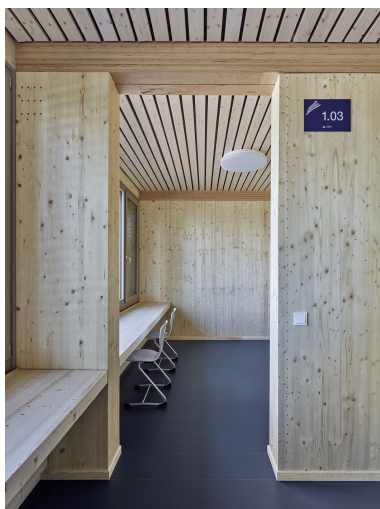
A lot of visible wood in the interior fittings ensures a pleasant indoor climate.