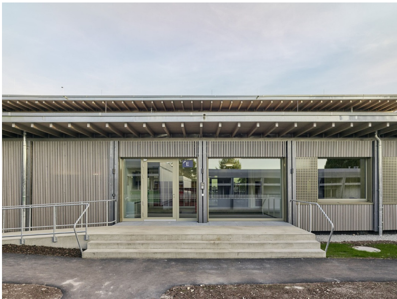
Barrier-free school entrance

A versatile place to feel good: Side room with interior fittings in wood.