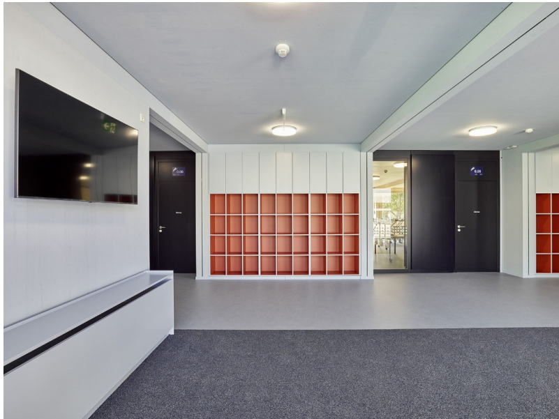
Invitingly designed entrance area with info screen