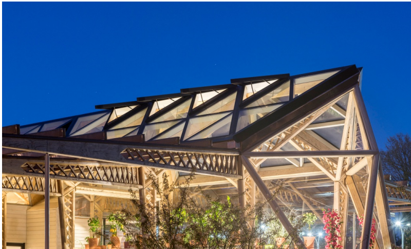
Timber roof construction