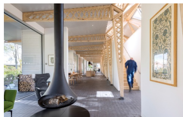
Exposed timber inside