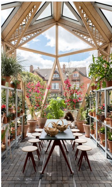
A light and airy interior