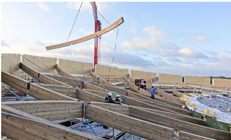
Construction work on the supporting structure.