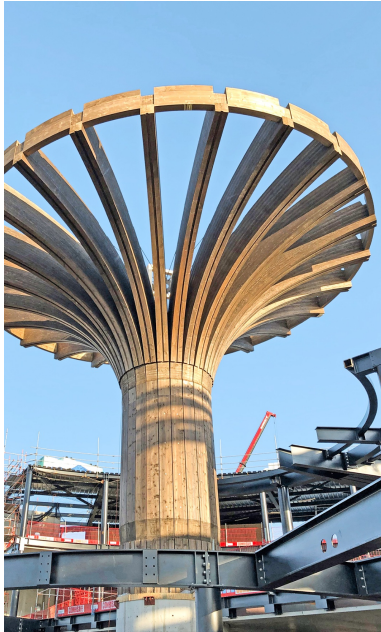
The flower stem – centrepiece of the atrium – extending upwards.