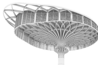
500m 3 of spruce wood were used to build the glamorous casino.