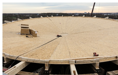
Detailed view of the roof construction during construction work