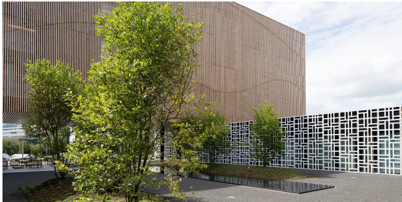
Facade design with vertical Douglas fir slats