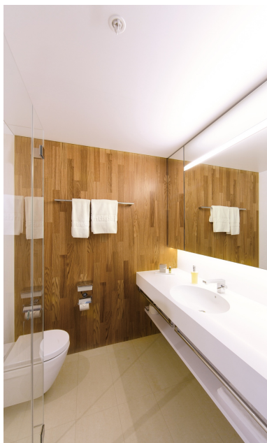
Bathroom module design