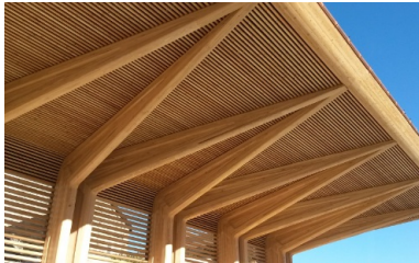
Close-up of the roof construction