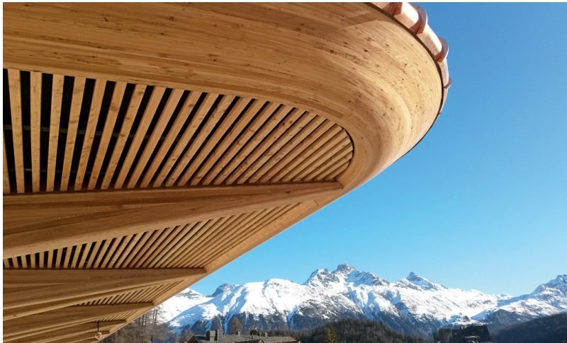
Unique roof construction in larch