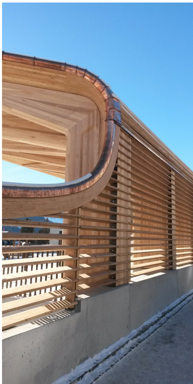
Tribune facing the road