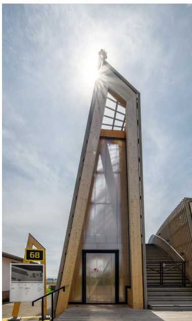
Entrance area in the free-form shell