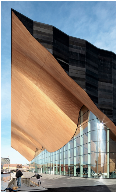
Side view of roof construction with connection to the glass facade