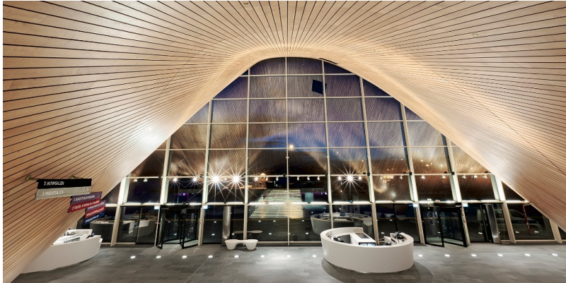
Sweeping free-form roof construction