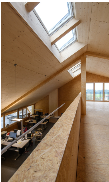
Generous office space