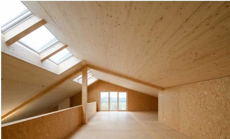
Spruce roof truss