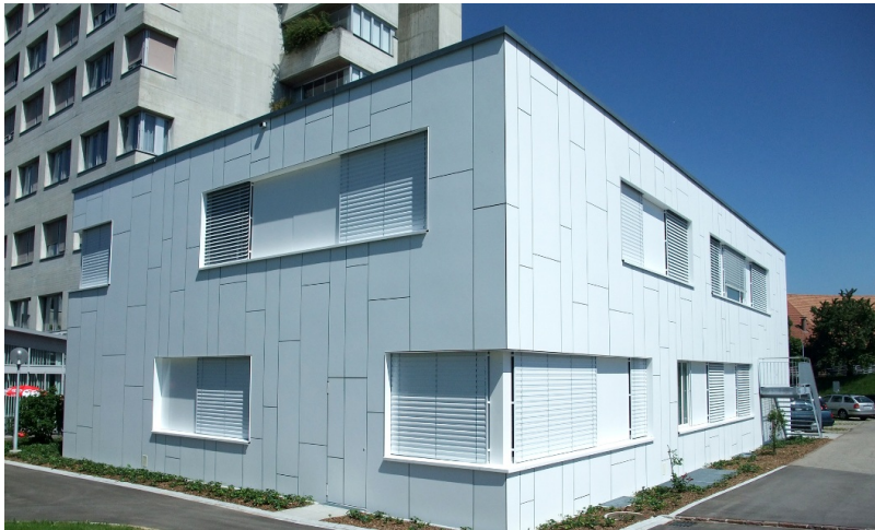
Two-storey temporary structure