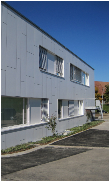
Two-storey temporary structure