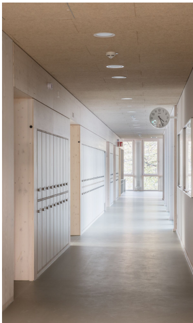
The 112 room modules in total were produced in our factory in Grossenlöder.