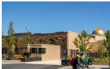
External view of Cambridge Mosque