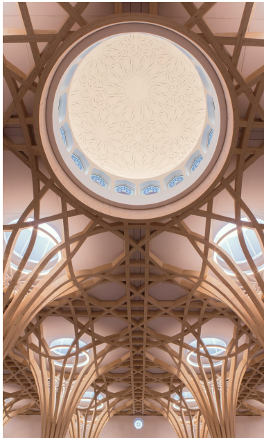
30 skylights bathe the mosque in light