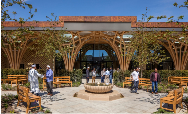
View of the mosque's atrium