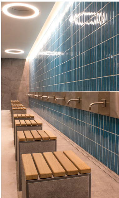
Place for the faithful to perform cleaning rituals