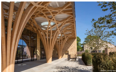
Entrance to the mosque