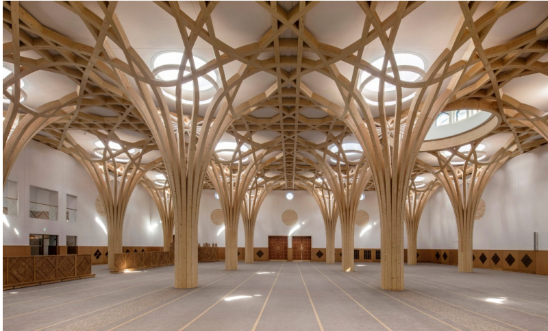
Prayer hall with free-form supporting structure