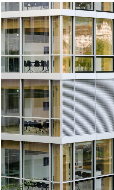
View of the timber skeleton frame