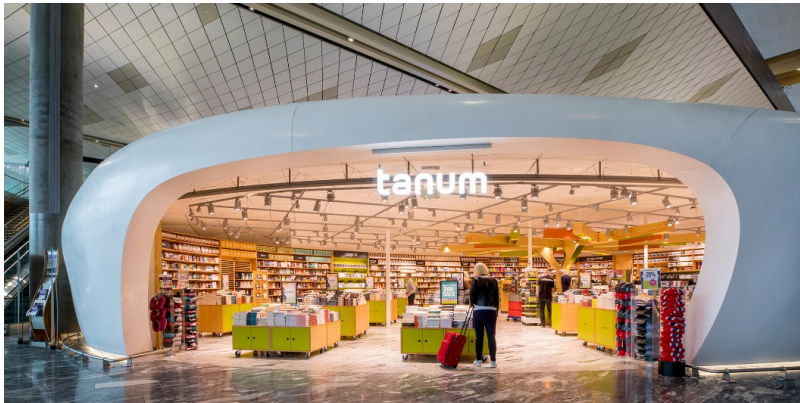
Pavilion in the transit zone