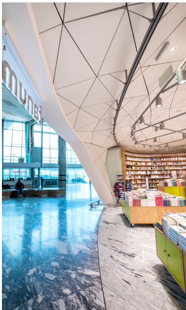
Close-up of clad timber construction