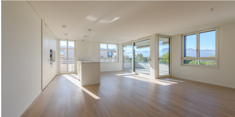
Living areas bathed in daylight