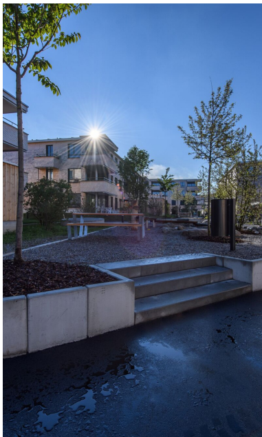
An atrium adds to the quality atmosphere