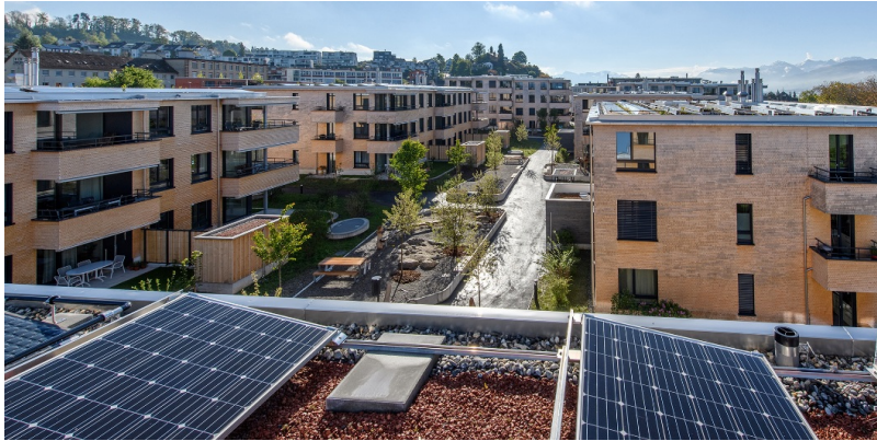
View of the development