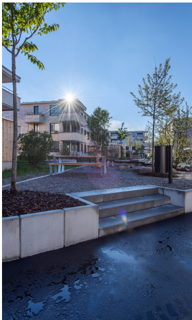
An atrium adds to the quality atmosphere