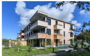
Shingle facade in Swiss timber