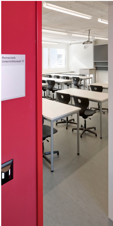
View of a classroom