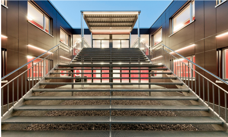
Staircase, temporary building, Baden cantonal school