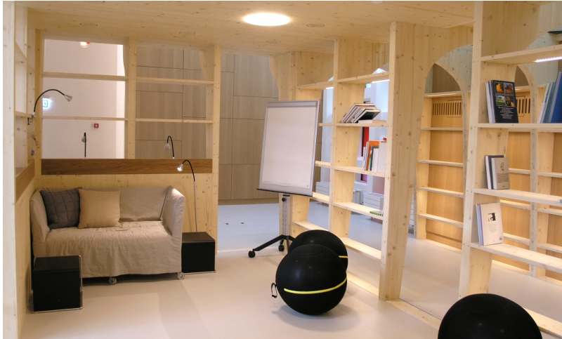
A quiet corner for individual study