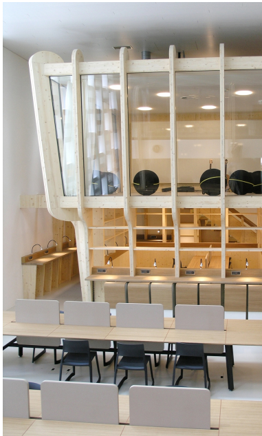
Classroom with different workstations